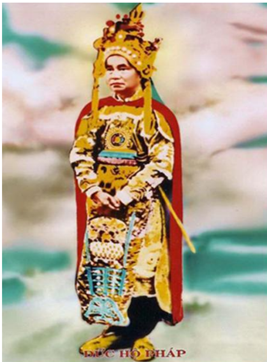
The portrait of His Holiness HO PHAP Pham Cong Tac in Great Ceremonial Vestment.