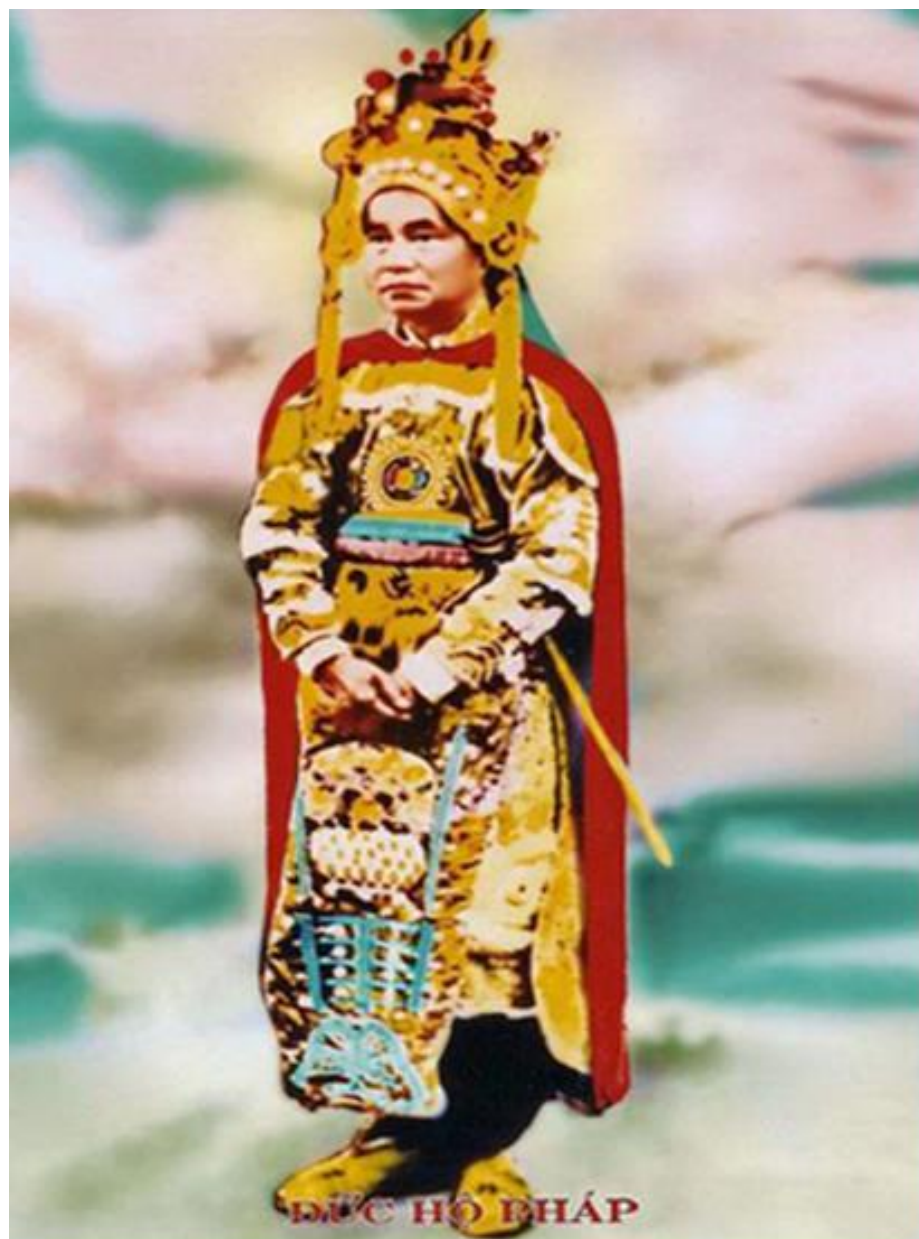
The portrait of His Holiness HO PHAP Pham Cong Tac in Great Ceremonial Vestment.