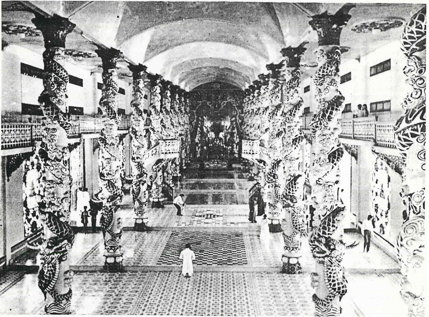
A view of the interior of Cao Dai cathedral showing ornate decor with intricately carved columns.

coined the word "metapsychic" to be applied to a series of phenomena, including spiritism. Richet was a member of the French Academy of Medicine and of the French Academy of Sciences.